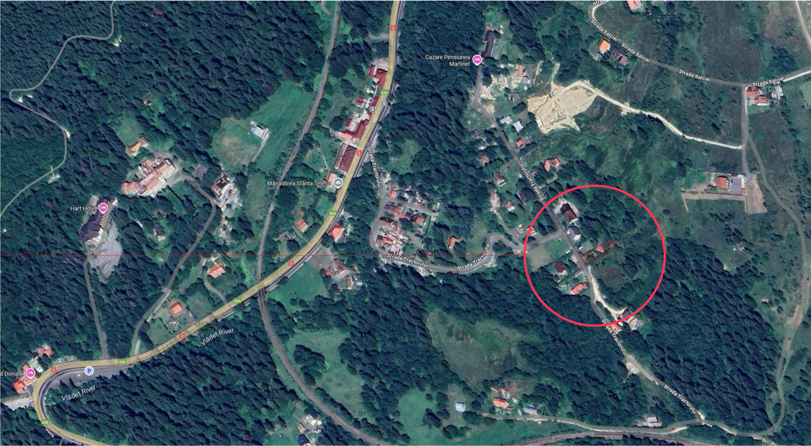
Teren studiat: Timisul de Sus / Predeal, CF 104 232 Predeal